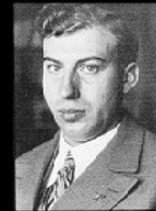
Staatssekretär Dr. Stuckart